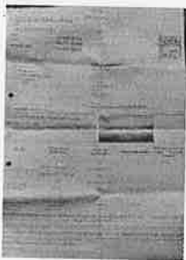
Kaveri PUC.jpeg 52K