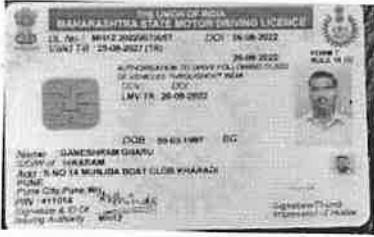
Driving Licence .jpeg 31K