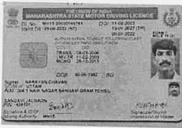
Driving Licence01 .jpeg 34K